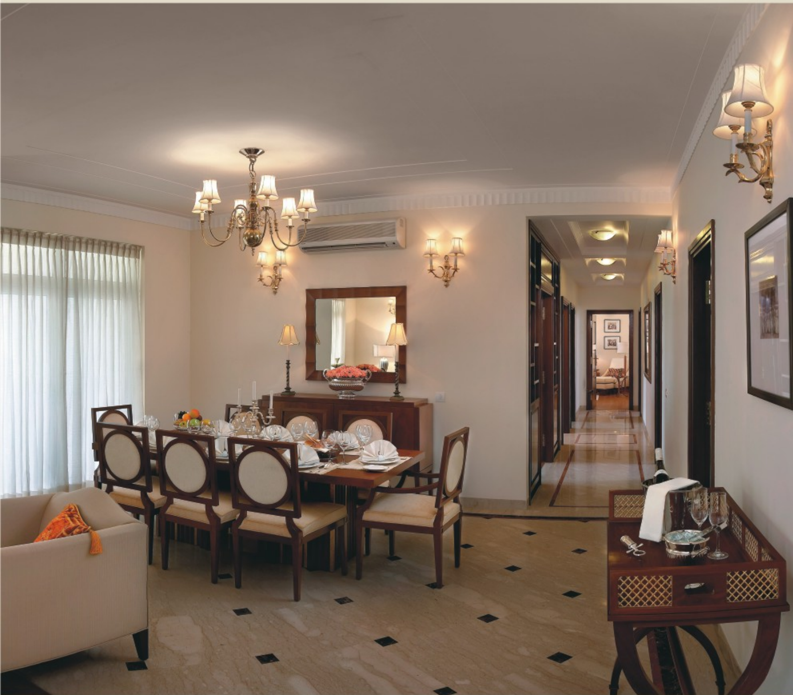
Actual photograph of Belgravia apartment at Central Park II