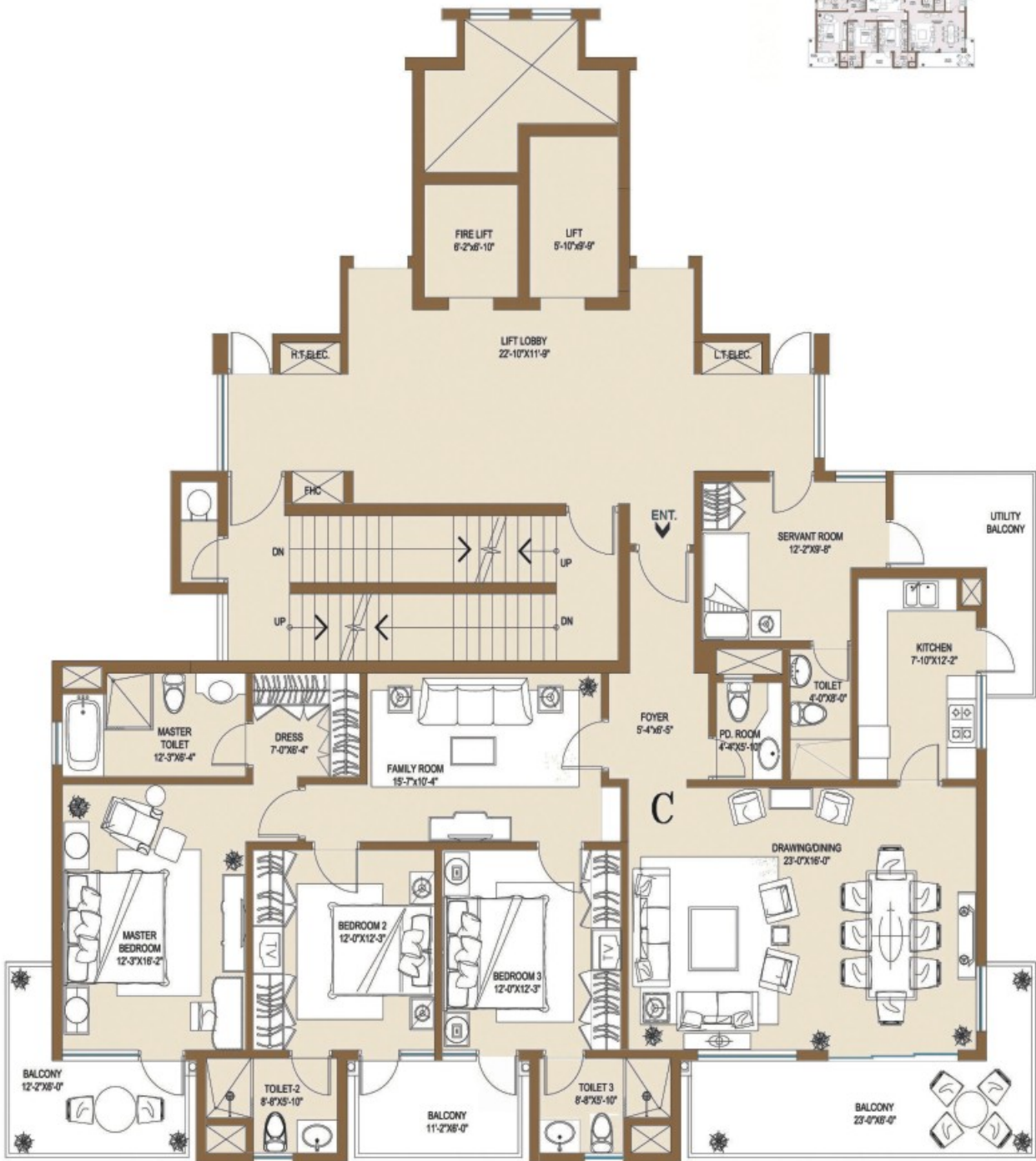
Tower A Type C - Front Facing 3 bedroom apartment Approx. Super Area 2590 sq. ft.