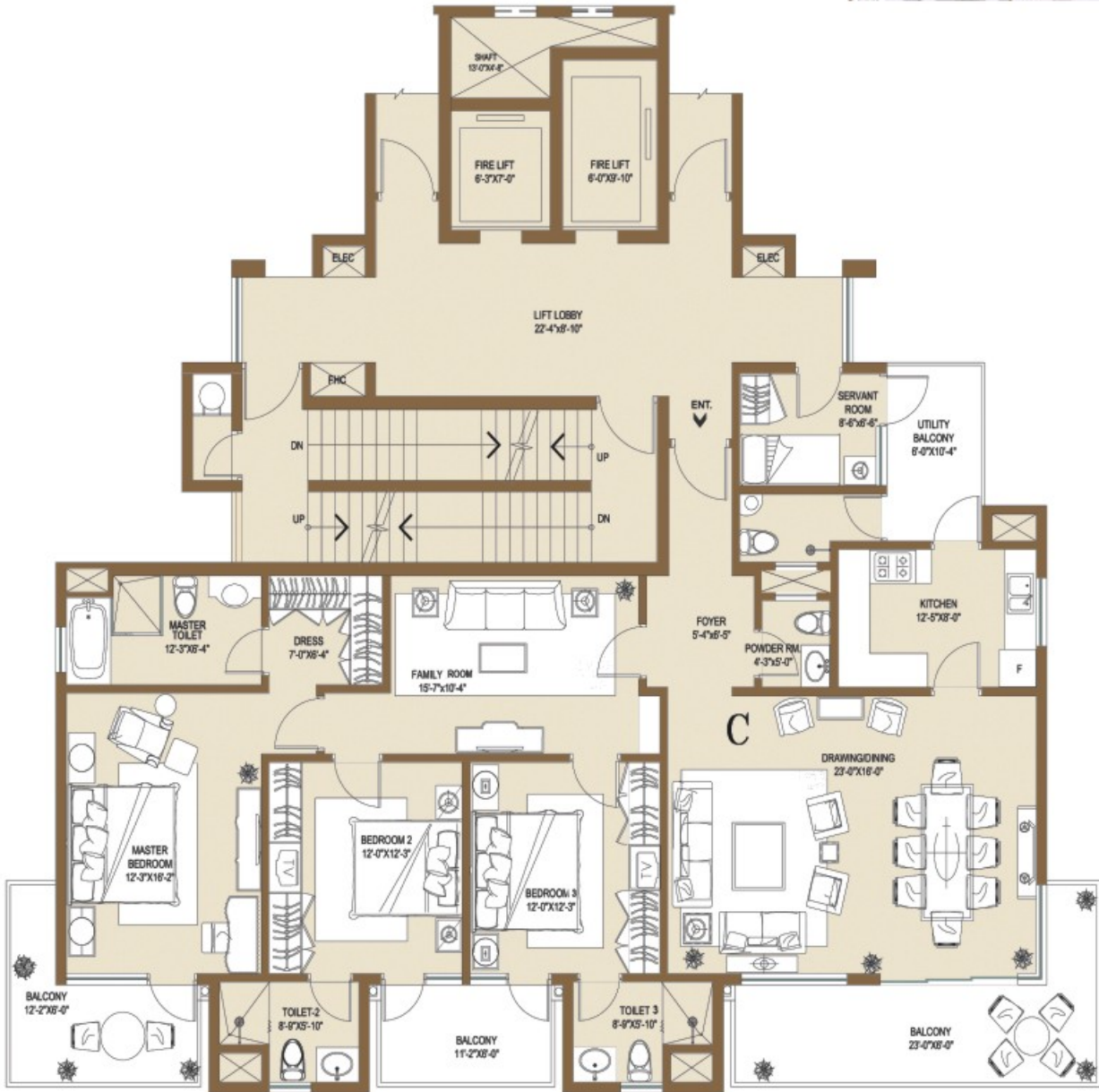
Tower B Type C - Front Facing 3 bedroom apartment Approx. Super Area 2550 sq. ft.