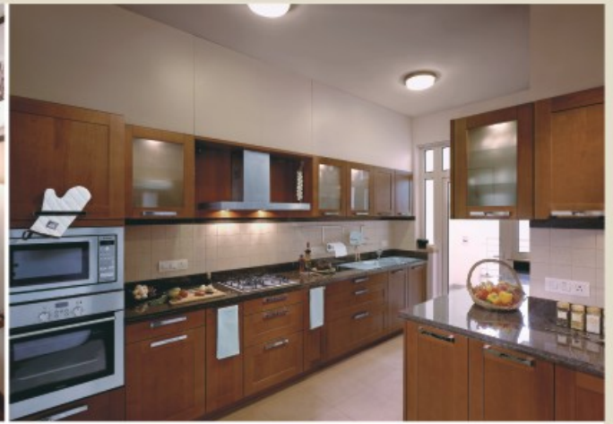
Actual photographs of Belgravia apartment at Central Park II